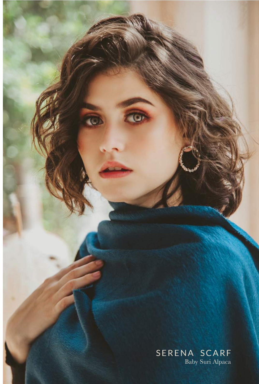
SERENA SCARF Baby Suri Alpaca