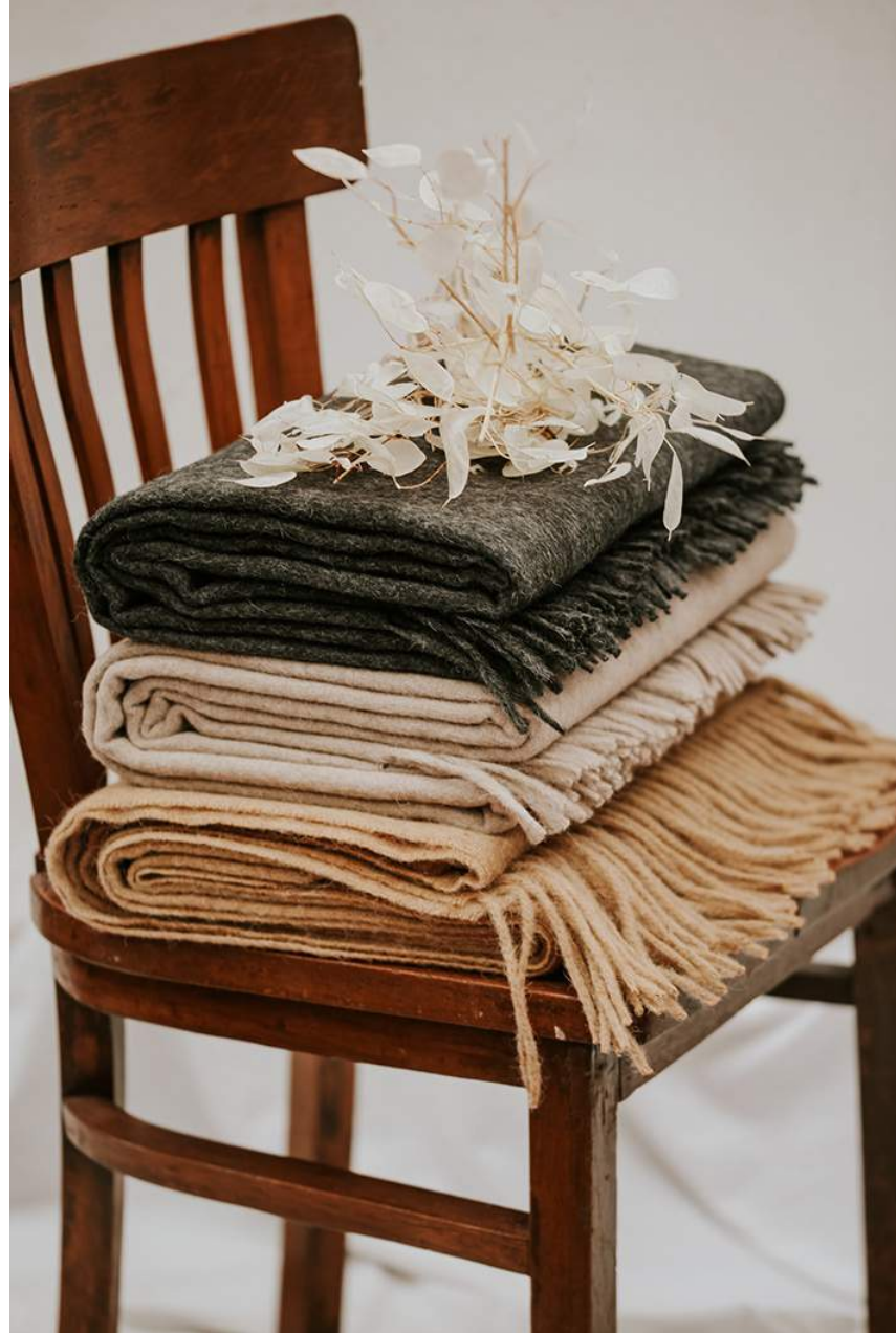
HONEST BLANKET Alpaca Blend