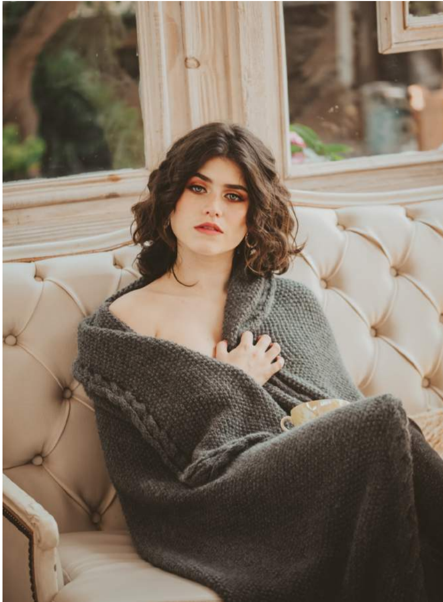
UNIQUE TRESS BLANKET Hand crafted from 100% Baby Alpaca