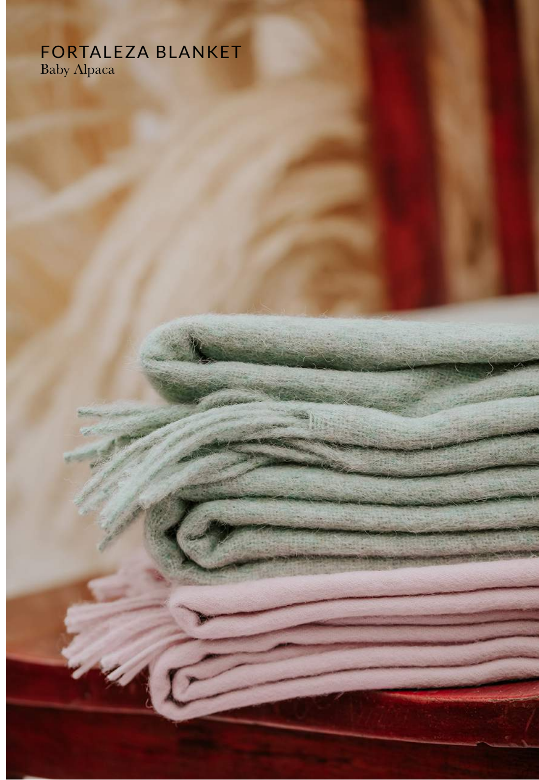
FORTALEZA BLANKET Baby Alpaca