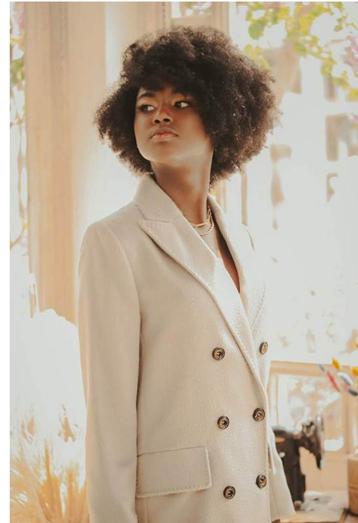
BOSSY COAT Baby Suri Alpaca