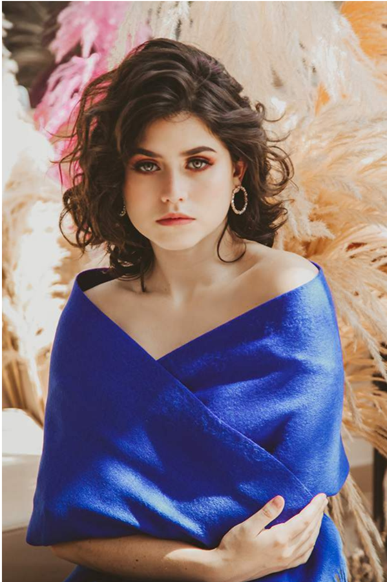
VIRTUOSA SCARF Baby Alpaca