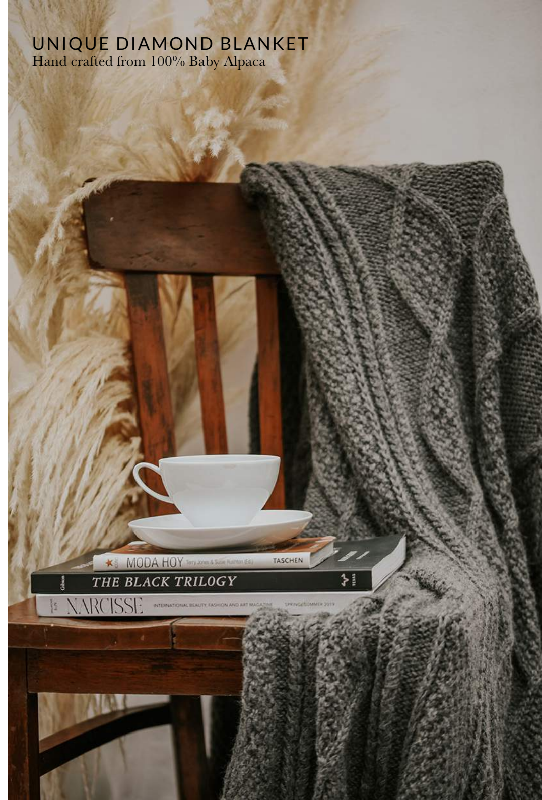
UNIQUE DIAMOND BLANKET Hand crafted from 100% Baby Alpaca