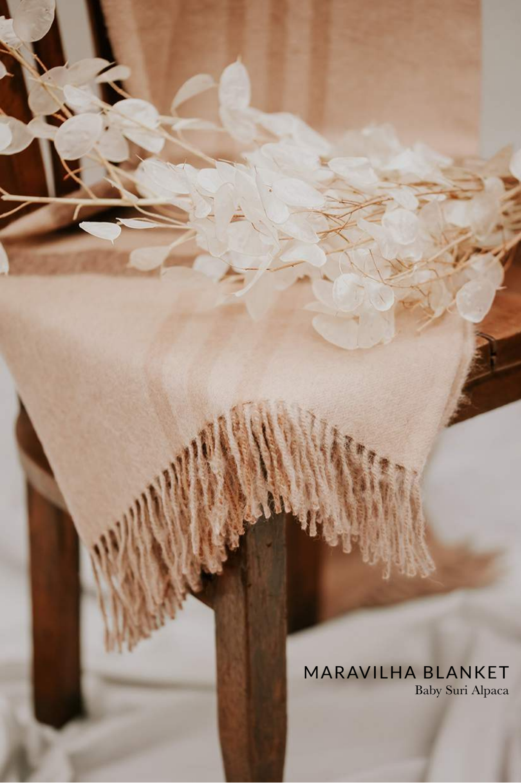
MARAVILHA BLANKET Baby Suri Alpaca